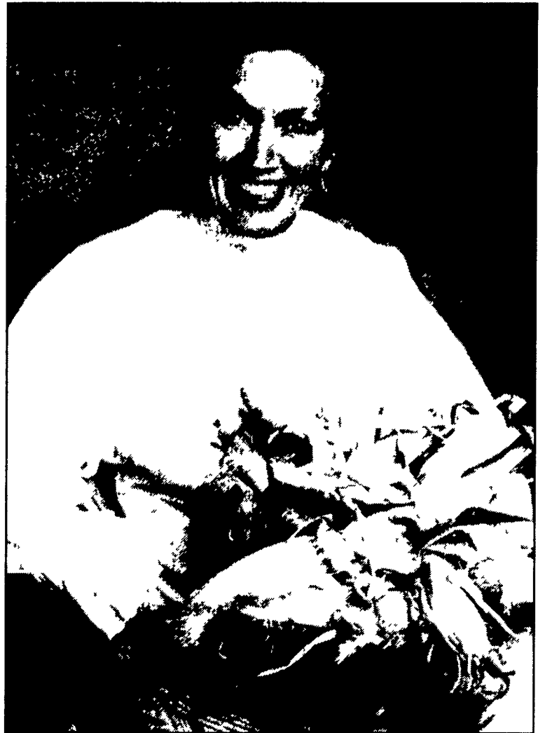
"I'm always happiest when surrounded by corn," said Betty Fussell. She will be make a special guest appearance Aug. 12-14 at Cherry-Crest Farm's Amazing Maize Maze to sign her cookbooks and share favorite corn recipes and tips.

Grind the cinnamon, cloves, and peppercorns in a spice grinder and add to the purée. Add the wine, orange juice and half the vinegar, and purée until very smooth. Taste for sweetness and add the rest of the vinegar or add honey if needed. Serves four.