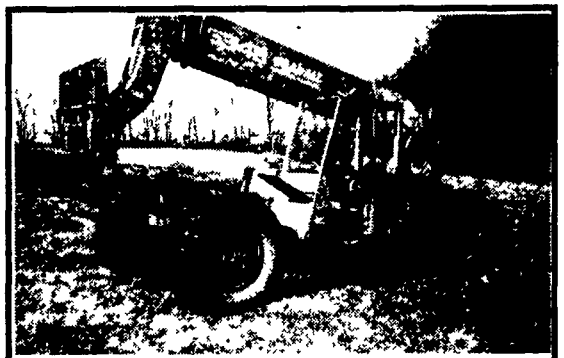
534B Gradall 36' Shootboom, Forklift, Tilt Chassis, only 4,000 Hours, asking $28,800 (610) 916-6935