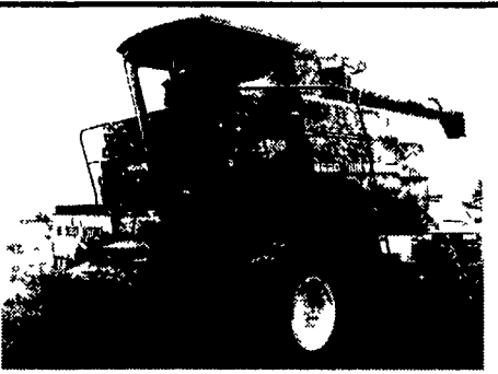
JD 6620 Sidehill Titan II, 2wd, chopper, auto header, 3200 hrs $35,000 W 2960