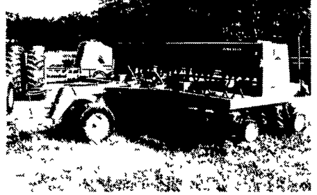
JD 750 no-till drill 15' $15,900 Q 6345