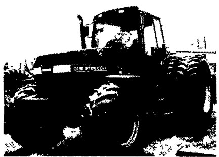
Case IH 7140, 4570 Hrs duals, 20 8x42 18 4x26 front $62,500 Q 6455

Blue Mt. Small Engine Service 1490 Three Sq Hollow Rd Newburg, PA 17240 717-423-5358