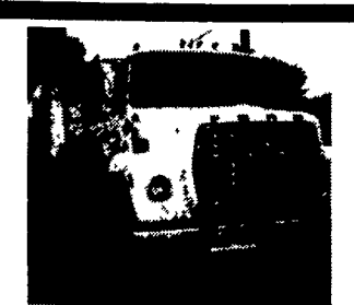
80 Ford LN900 Water Truck 477 V-8, 5 Spd., 2 Spd. Rear, 2400 Gal. Heil Stainless Water Tank, PS, AB, 10.00x20 Tires, 35,000 Lb. GVW