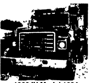
1980 IH Model 1824 446 V8, 5-spd., single rear, 4x4, w/13' angle snow plow, 10' dump body, air brakes, 10.00x20 tires