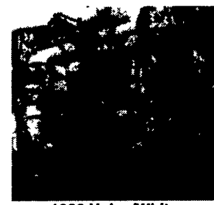
1988 Volvo/White 3306 Cat engine, 740 Allison, 44' Rockwell rears, 11x22.5 tires,