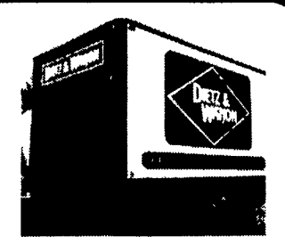
12' Reefer Body. under body refrigeration unit, Uses 220 electric. Has damage