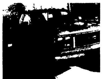
89 GMC Sierra SLE Chattanooga Choo Choo Custom, 4WD, 16" Aluminum Wheels, Running Board, 132,007 Miles

Ingersoll Rand Air Compressor, Type 30, 15 HP 3 Phase