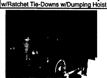
1948 International KB7 Cab & Chassis, 50,000 miles. 269 gas engine, 4 spd. trans., hydraulic brakes, excellent condition, been in storage over 30 years