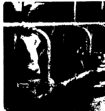
Heavy duty steel clamp & mounting bracket totally supports bowl.