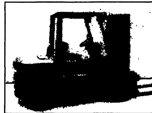
Toyota 8000 lb. Pneumatic 13' Lift, Diesel Powered, "Special Financing"