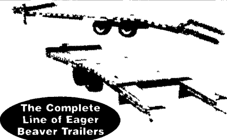
The Complete Line of Eager Beaver Trailers