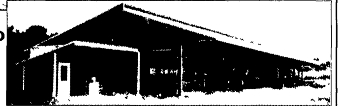
OPEN-SIDED HEIFER FACILITY