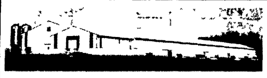
New Layer featuring Chore-Time Cages, Ultraflo® feeding and Chore-Time Turbo ventilation.

Needed by local egg production companies: Career farmers and family farms to build and manage egg layer houses or pullet houses