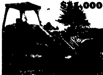
'79 Cat 955L 13X Series