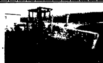
JD 670 Motor Grader 12' Blade, Cab, Good Running Cond.....$18,000