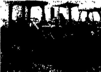
Cat 951C, Good Cond.