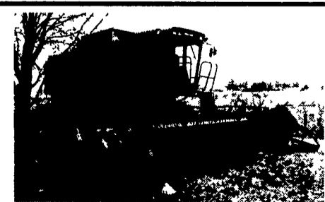
1994 Case IH 1688 4x4 Combine with 8 row corn 15' flex head, 20' flex head, 400 Hr $160,000