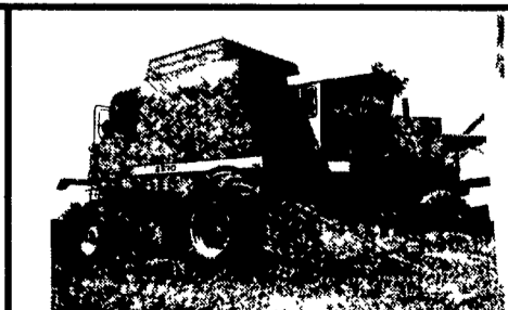
1996 MF 8570 4x4 Rotary Combine, 1250 Hr w/6 Row 863 Corn Head $130,000