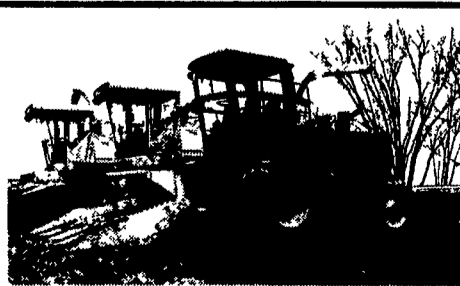
JD 5830 4x4 Harvester 1990, 7 Hay Head, 4 Row Corn Kernel Processor, 2500 Hr. $93,000