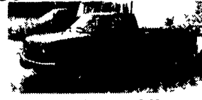
95 CHEV K2500 350 V8, 4x4, AT, Cheyenne Pkg, 72,000 Miles