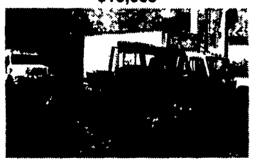
99 International 4700, 20 Ft. Steel Roll Back, Wheel Lift, Loaded, Demo, Must Move $40,900