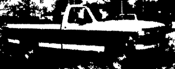
1 TON POWERSTROKE 96 FORD F350 XLT Real, Nice, Only 21,000 Miles Awesome Powerstroke Turbo Diesel, AT, A/C, Lockout Hubs, Aluminum Wheels, Solid Front Axle