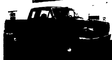
1996 Ford F-150 XL Ext. Cab Shortbed, 4x4, 4.9C, 5 Spd., PS, PB, A/C, Stereo, Dual Tanks, 76,700 Mi. $13,900