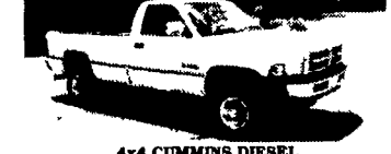
4x4 CUMMINS DIESEL 97 DODGE 2500 SLT LARAMIE Loaded With Options, Very Nice, Only 28,000 Miles, Cummins Turbo Diesel, AT, A/C, Power Everything, Trailer Pkg., Heavy Duty 3/4 Ton