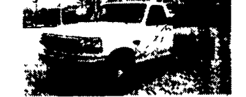
4X4 CHASSIS 97 FORD 350 XLT Strong Powerstroke Turbo Diesel, 5 Sp., A/C, Dual Tanks, Limited Slip, 4:10 gear sht 137 W.B., Waiting For Your Body, Priced Right $21,900