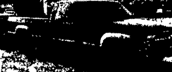
94 CHEVY K2500 SUPER CAB 4 Wheel Drive, Beautiful Silverado, Fuel Inj. 350 V8, Auto A/C, Tow Pkg., 4:10 Gears, Capt. Chairs, Consoles, A Real Good Looker