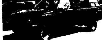
1 TON 5 SP. DIESEL 99 FORD F350 4x4, Nice Tk., Only 13,000 Miles, Remaining New Tk. Warranty, Powerstroke Turbo Diesel, 5 Sp., A/C $25,900