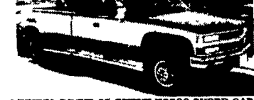
6 WHEEL DRIVE 95 CHEVY K3500 SUPER CAB DUALY Real Nice, Local Trade, High Output 6.5 Turbo Diesel, AT, A/C, Loaded, Silverado, Tow Pkg., 4 10 Gears, Check It Out $21,900