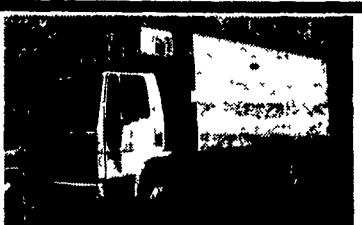
1990 Ford CF8000 w/20ft. Refrigerated Body, RD-II Max, Refrigeration Unit $18,000