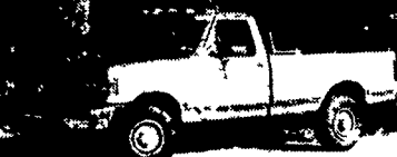
5 SPD., DIESEL 88 FORD F250 7.3 Diesel 5 Spd. Trans. A/C Heavy Duty 8600 GVW, Lockout Hubs, Dual Tanks