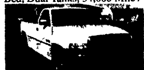
95 DODGE RAM 2500 4X4 Cummins Diesel, AT, 53,000 Miles