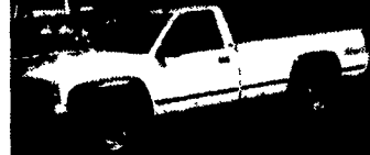
95 GMC K2500 4x4 Heavy Duty 8600 GVW, High Output 6.5 Turbo Diesel AT, A/C, Tilt, Cruise, Vinyl Floor & Tow Pkg., Runs & Drives Real Nice $17,900