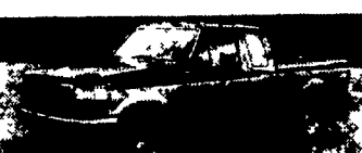
SHORT & SWEET 6 FT. BED 97 FORD F250 SUPER CAB 4 WHEEL DRIVE Perfect Only 22,000 Miles, Powerstroke Turbo Diesel, 5 Sp., A/C, Loaded XLT, Aluminum Wheels, Only 22,000 Clean Miles