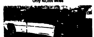
HORSEY HAULER 96 DODGE 3500 4X4 Fiberglass Aero Tow, low Body, Gooseneck Hitch, Cummins Turbo Diesel, Heavy Duty 5 Sp., A/C, 4:10 Gears. This Tk Will Get The Job Done