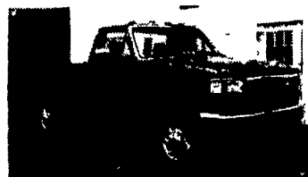
1995 Ford F250 XL 4x4, 460, AT, PS, PB, A/C, Cass., Delay Wipers, Dual Tanks, 8600 GVW, 70,800 Mi. $13,900

3394 Division Hwy., New Holland, PA 17557 • (717) 355-0644