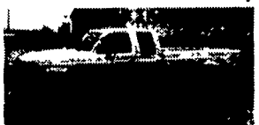
96 FORD F250 EXT. CAB XL, 351 V8, 5 Spd., A/C, 4x4, Long Bed, Dual Tanks, 34,000 Miles

1200 North Reading Rd., (Rt. 272) Stevens, (Lancaster Co.) PA 17578 717-336-3130