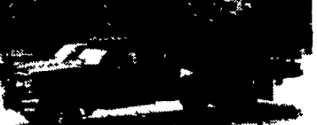
STAKE BODY DUMP 94 FORD SUPER DUTY Heavy 15,000 GVW, Powerstroke Turbo Diesel, Auto, A/C Only 32,000 Miles Real Nice & Real Hard To Find