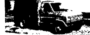
MECHANIC'S TRUCK, 89 FORD E-350 UTILITY Nice, Clean, Ready To Work, Only 29,000 Miles, V8, Auto, Comes Equipped With Air Compressor & Electric Generator