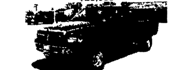
5 SP. CUMMINS 97 DODGE 2500 4x4 Heavy Duty 3/4 Ton, Strong Cummins Turbo Diesel, 5 Sp., A/C, 4-10 Limited Slip Gears, 46,000, Very Clean, Very Nice, $23,900