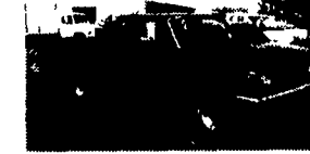
91 FORD F150 SUPER CAB 4X4 XLT, V8, AT, Most Options, 72,000 Miles