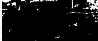
4x4 DUALY 94 DODGE 3500 Big Time Tow Machine, Strong Cummins Turbo Diesel, AT, A/C, Dual Rear Wheels, Only 47,000 Miles