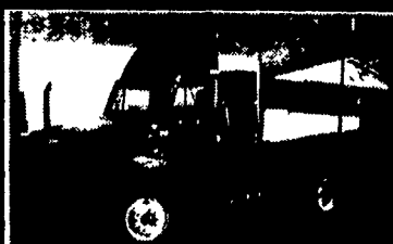
83 International Single Axle Cummins L10, A/C, 240 HP, 7-spd. Spicer, air brakes $8,500