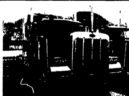
1992 Peterbilt 379, DTS60, 12.7L, 145 HP; Fuller 15 OD Trans, Air Ride Susps; 40,000# Rear Axle, Ratio 3:70