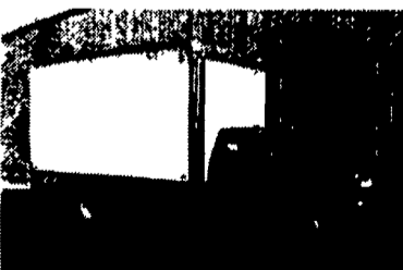
1992 FORD F350 DUALY 7.3 Diesel, AT, A/C, PS, 14 ft. Supreme Body