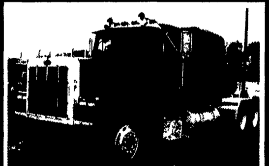
1989 Peterbilt 379, 63" Sleeper, 400 Cummins, Jake Brake, 15 Speed, 4:10 Ratio, Air Ride Susps., Wet Line