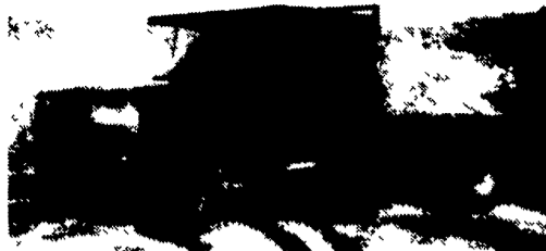
1992 F450 XLT with 12' bed, 460 5-spd., 15,000 lb., set up for towing, 1-owner, asking $14,900 $13,995