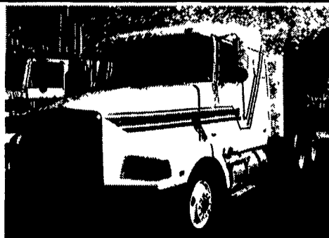
1992 Volvo, Cummins N14-430 HP, Jake Brake, 9 Speed, 220 Wheel Base, 60" Sleeper, 3.91 Ratio