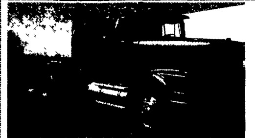
1989 IH F9370 EAGLE w/Sleeper, 444 Cummins, 13 Spd., Wet Line, Air Ride 11R24.5 on (10) Aluminum Wheels, Jake Brakes, New Inspection, 436k Miles, New Holland, PA $14,900 717-354-3199