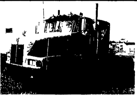
1987 Kenworth T6000, 40" Sleeper, NTC 400 Cummins, 9 OD Speed Trans., Jake Brake, 8 Bag Air Ride, 4:44 Ratio.