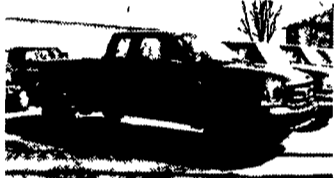
99 FORD F250 SUPER CAB 4x4, 5.4 Triton V8 Eng, 5 Speed, A/C, AM-FM, 4 Doors, 8,800 GVW, 4 10 Rear, One Owner, Dk Green, 15,000 Miles $25,500