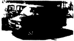
97 CHEV ASTRO EXTENDED V-6, AT, A/C, PW, PL, C, Green, 51,000 Miles

SPECIALIZING IN TRUCKS & VANS 1200 North Reading Rd., (Rt. 272) Stevens, (Lancaster Co.) PA 17578 717-336-3130