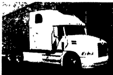
IN STOCK MACK VISION CX-2000 Call For Details