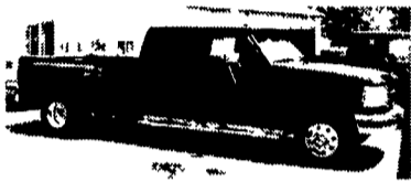
95 FORD F350 XLT CREW CAB Dually, 460 Fuel Injected, AT, A/C, AM/FM Cass, PW, PL, 10,000 GVW, 4 10 Rear, Local Truck 17,000 Mi Black $19,900