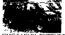
91 GMC SAFARI EXTENDED SLE, AWD, V6, AT, Dual A/C, 99,000 Miles, Black