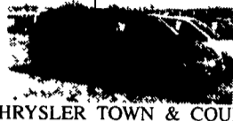
92 CHRYSLER TOWN & COUNTRY V6, AT, Dual Air, 7-Passenger, Most Options, Leather, 78,000 Miles SPECIAL - $7,995