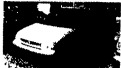
96 FORD WINDSTAR GL V6, 7 Passenger, AT, A/C, PW, PL, 65,000 Miles