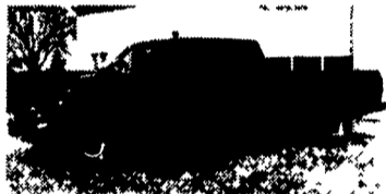
96 CHEVY 3500 CHEYENNE CREW CAB 4WD, 350 Vortec, 5 Spd, A/C, AM/FM, Cruise, 9200 GVW, 4 10 Hyd Slip Rear, 49,000 Miles, Dark Blue $20,900