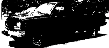
96 GMC 2500 SL 4WD, 350 Vortec, 5 Spd, A/C, AM/FM Cass, Cruise, Tilt, 8600 GVW, 3 73 LTD Slip Rear, 76,000 Mi, Dark Green $14,900