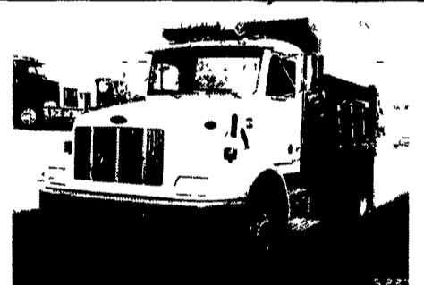
NEW Peterbilt 330, 10' Dumps, Cat & Cummm. Power, 9 Spd, 33,000 GVW, Locking Rear, Air Ride 10:23 Axles