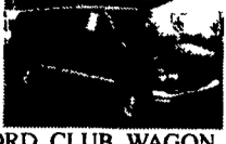
96 FORD CLUB WAGON XLT V8, AT, Dual A/C, 12 Pass, Most Options, Red & Silver, 65,000 Miles