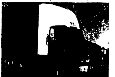
1992 IH 8100 Cummins L-10 310HP 9-Speed Spicer, Reyco - 4:10 R, 146" WB