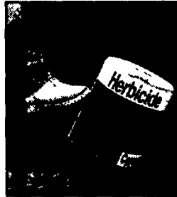
Kick the herbicide habit with low cost weed control