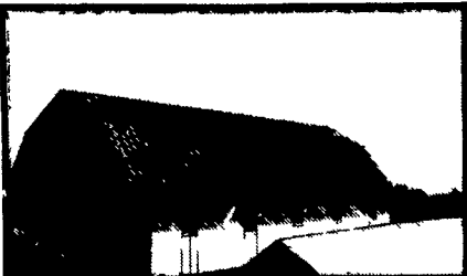
Use on Barns Or Garages