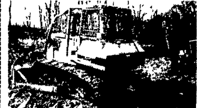
Komatsu D58E, 88 Model, 3600 Hrs $39,000