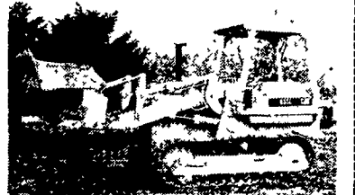
Cat 955L 4-in-1 Bucket, Good UC, Excellent $25,000

JD 655B, LGP Crawler Loader, 88 Model, New SALT U C Coming In JD 410D Cab, 4x4, Ext Hoe $27,000