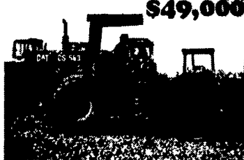
'94 CAT CS563 Roller Drum Drive

No Reasonable Doubt Repairs Custom Repairs On All Makes of Farm Equipment