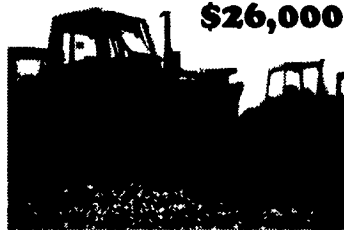
'85 JD 655 Cab