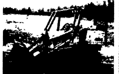
Case 455C Crawler Loader, Cummins Diesel, Good UC, 3,200 Hrs $16,500