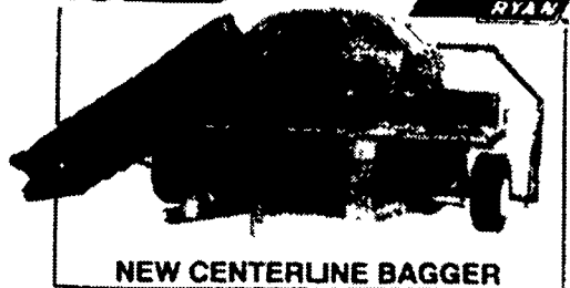
NEW CENTERLINE BAGGER

Get "Harvest Fresh" Silage with Higher Feed Value at Lower Cost NORTHEAST DISTRIBUTORS & EQUIPMENT