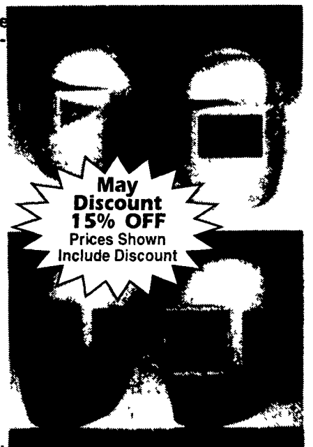
OPTIONAL SIDE WINDOWS

Speedglas SideWindows™ lenses increase the viewing area by 100% in Speedglas XL models and by 113% in Speedglas APC models. Ideal for Speedglas Fresh-air respiratory systems.