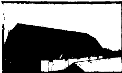
Use on Barns Or Garages