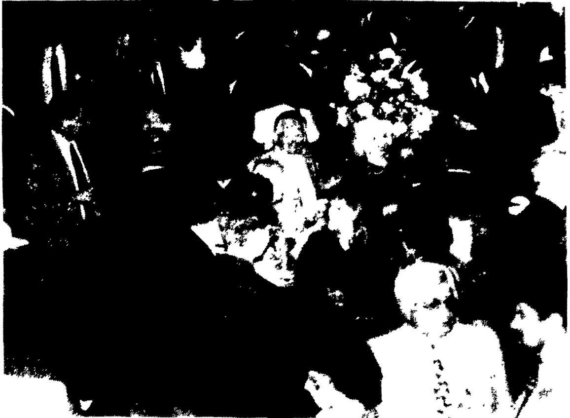
More than 1,000 people attended the Spring Poultry Banquet of the PennAg Industries Poultry Council. Evening festivities began with hors d'oeuvres followed by dinner and entertainment.

(Continued from Page A1) PennAg and formed the Poultry Council. PennAg Industries is now the umbrella organization to represent poultry, agronomic products, and feed and grain councils.