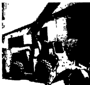
Clark Crane, 14 Ton Capacity, 4-53 Detroit, 60' boom, 14 00x24 tires, runs good serial #720