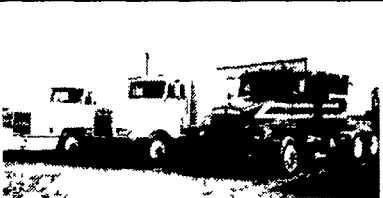
90 - Mack CH613, 350 H P, A/R, 15 Sp $19,000 87 - Kenworth T-600 Cat 3406, 15 Sp, A/R $12,900 86 - Kenworth T-600 Cummins, 400 H P 15 Sp, A/R $16,900