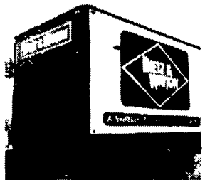
12' Reefer Body, under body refrigeration unit, Uses 220 electric Has damage