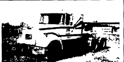
87 White Volvo, Cummins 350, 9 Sp, Wetline $8,000