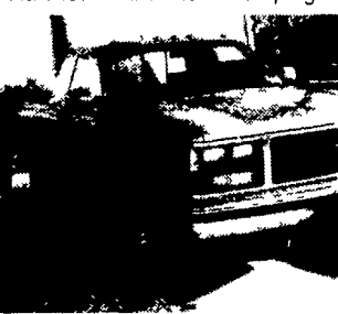
89 GMC Sierra SLE Chattanooga Choo Choo Custom, 4WD, 16" Aluminum Wheels, Running Board, 132,007 Miles