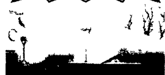
Aluminum Tanker/Trailers 7500 gal and up

4 I-Beams 49' Long, 28" High w/12-1/2" Web