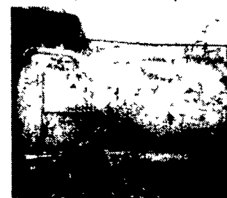
1500 gallon Sludge Tank