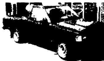
1993 Toyota Pickup 4 Cyl, 5 Spd Trans, AM-FM Radio, A/C, Excellent Condition, High Mileage

19' NEW Lumber Body w/Ratchet Tie-Downs w/Dumping Hoist