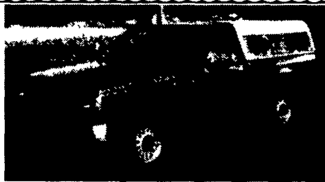
1985 Chevy S10 Pickup 4x Brown, 2.5 FI, 4 Spd $2,500 OBO

No Sunday Calls Days (717) 336-2507 Evenings (717) 335-3247 (Stevens)