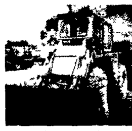
W7 Case Loader, 15 5x25 tires, runs good serial #9900486

4 I-Beams 49' Long, 28" High w/12-1/2" Web