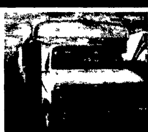
83 GMC - 16 Passenger Mini Bus V-8, Auto, Runs Good