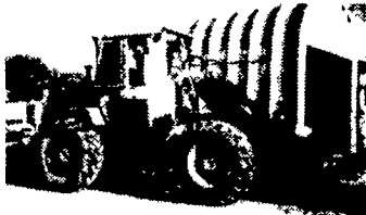
Michigan Loader Model L30 Quick Coupler, Comes With 1 Yard Bucket and 60" Forks, Runs Excellent

19' NEW Lumber Body w/Ratchet Tie-Downs w/Dumping Hoist