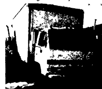
91 Isuzu NPR 4 Cyl, Auto, 14' Morgan Van Body 195,969 Miles

11.1 60 series Detroit engines 12.7 60 series Detroit engines 8.2 non-turbo Detroit engines