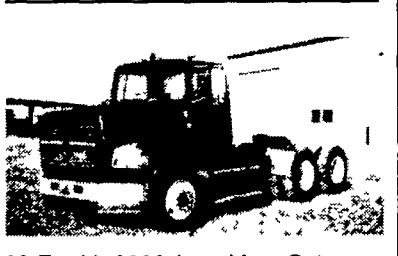
93 Ford L-9000 Aero Max, Cat 3406C, 350 H.P. Jake, 9 Sp, 40,000 Rears, Air Ride, New Brakes, Good Rubber... $17,900