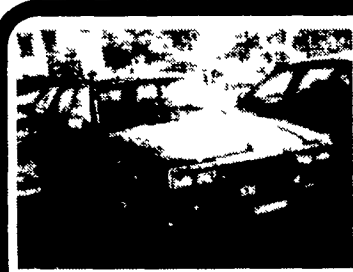
83 Eagle Wagon Ltd. 4 WD - 115,000 Miles