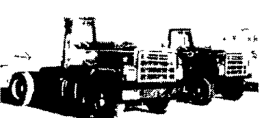
2 - Int Single Axle Truck Tractors, Cummins Diesel, 290 H P, 9 Sp, Air Brakes each $5,800