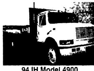
94 IH Model 4900 DT466 engine, 5 spd, single rear, air brakes, A/C, 32,900 GVW, double frame, 11x22 5 Budds, 254' W B 19' NEW Lumber Body w/Ratchet Tie-Downs w/Dumping Hoist