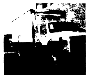
1988 IH S-1594 DT466 Engine, 5 Spd, Single Rear, 18' Van Body, 26,500 GVW