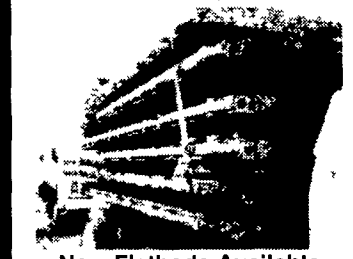
New Flatbeds Available Sizes currently available are 12', 14', 20', 22' and 24' Racks are also available