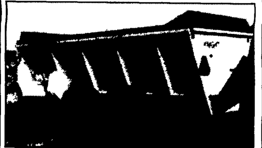
Model 8030 (Unit Shown in Picture), 2780 Gallon, 372 cu ft, Very Limited Supply - Ask For Amos!

Choose From (2) Knight V Spreaders In Stock