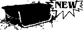
Cattle & Sheep 5' Galv. Feed Bunks - GFB-5P - GUB-5P