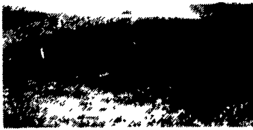
Round Bale Carrier Can Load w/ 3 PT. Spear