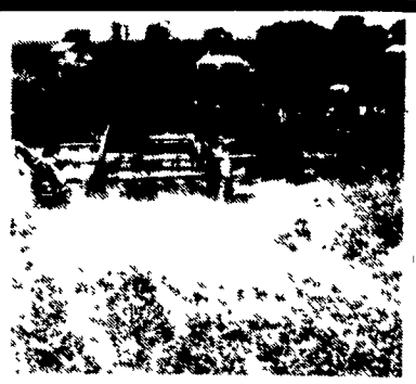
Tandem Hay Rake Hitch