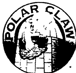
Polar Claw and the Polar Claw logo are trademarks of Patz Sales, Inc.

Distributor to deflect feed when filling for improved packing. For larger silos, a motorized kicker can be added.