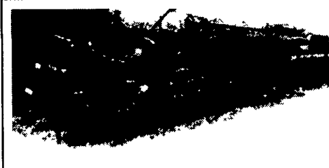
Series 1200 Disc