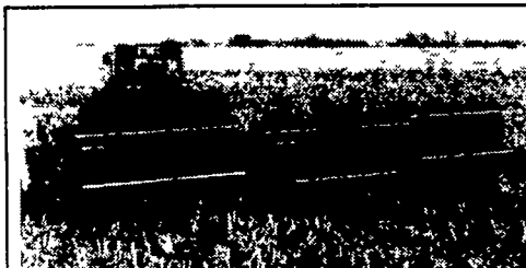
Series 9000 Grain Drills

Boiling uplifting action in the soil allows water to enter and be retained in subsoil minimizing runoff. Yield increases up to 10 bu more corn per acre * Lancaster Co farmer