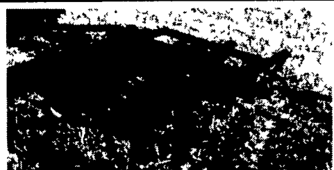
Model 4200 Trash Mulcher