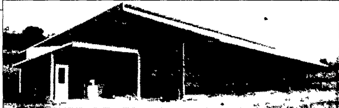
OPEN-SIDED HEIFER FACILITY