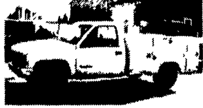
88 GMC 3500 SIERRA w/Stahl Utility Box, V8 4 Spd 80,000 Miles