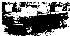
91 CHEV 2500 4x4 V8, AT A/C 71,000 Miles

1200 North Reading Rd., (Rt. 272) Stevens, (Lancaster Co.) PA 17578 717-336-3130