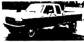
93 FORD F250 Ext Cab 4x4 Long Bed, V8 Gas or Propane, AT, XLT, 68,000 Miles