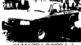
94 MAZDA B4000 4x4 V6, 5-Spd, 53,000 Miles, Special $9,500