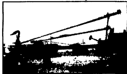
1988 Houle 32' Lagoon $5,000