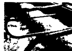
One man can put bedding material exactly where you want it without hand work

Now you can save about 75% of the time and labor for applying wood shavings, sawdust, or sand for free stall bedding. One operator can put in new bedding by himself with no hand-spreading necessary. The Millcreek Bedding Spreader is adjustable, and puts material exactly where you want it in the thickness you want. There's nothing like it for fast, efficient, and cost-effective application of bedding material in free stall dairy barns.