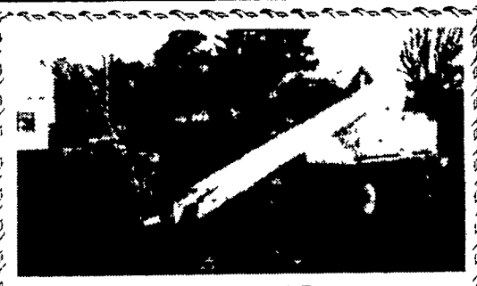
JLG 60G, 1981 Deutz Diesel Engine, two man basket lift in good condition, reach is 42 ft, complete rebuilt hydraulic pump, must see to appreciate......$18,000