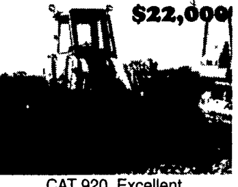
CAT 920, Excellent