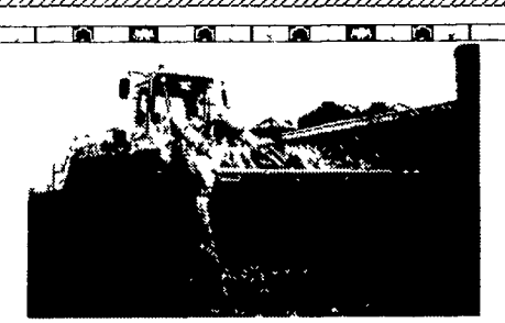
1989 Terex 90C Wheel Loader, 1600 Hours On Meter......Call

Financing and Lease Purchase Available • No Sunday Calls