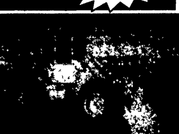
JD 644 C. Excellent