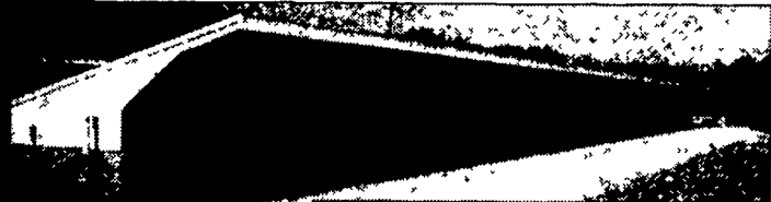
OPEN-SIDED CALF FACILITY

Check with Agri-Inc. where quality is our standard.