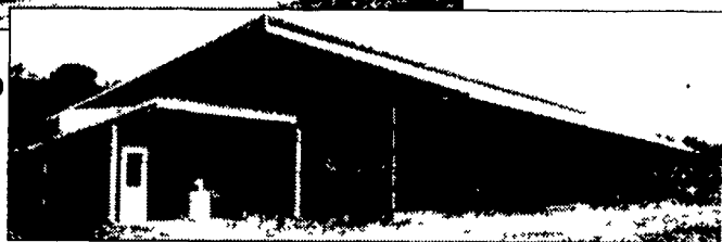
OPEN-SIDED HEIFER FACILITY