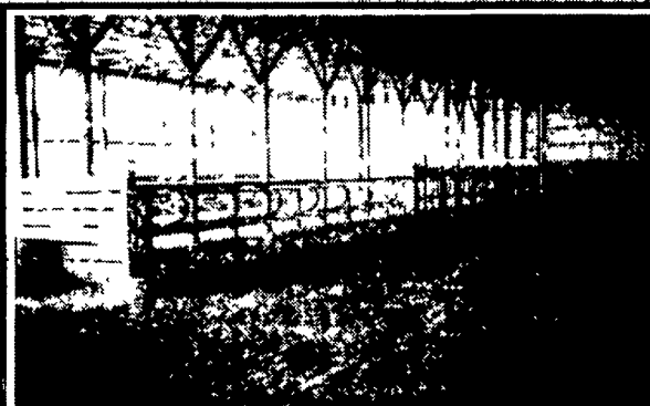
Slatted Free Stall Barn

Precast Concrete Bunker Silos or commodity buildings built to suit your needs. Bunkers available in 8 Ft. or 12 Ft. High.