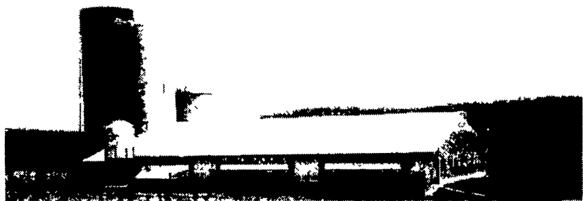
Slatted Beef Barn