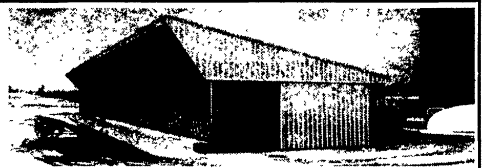
Slatted Heifer Barn