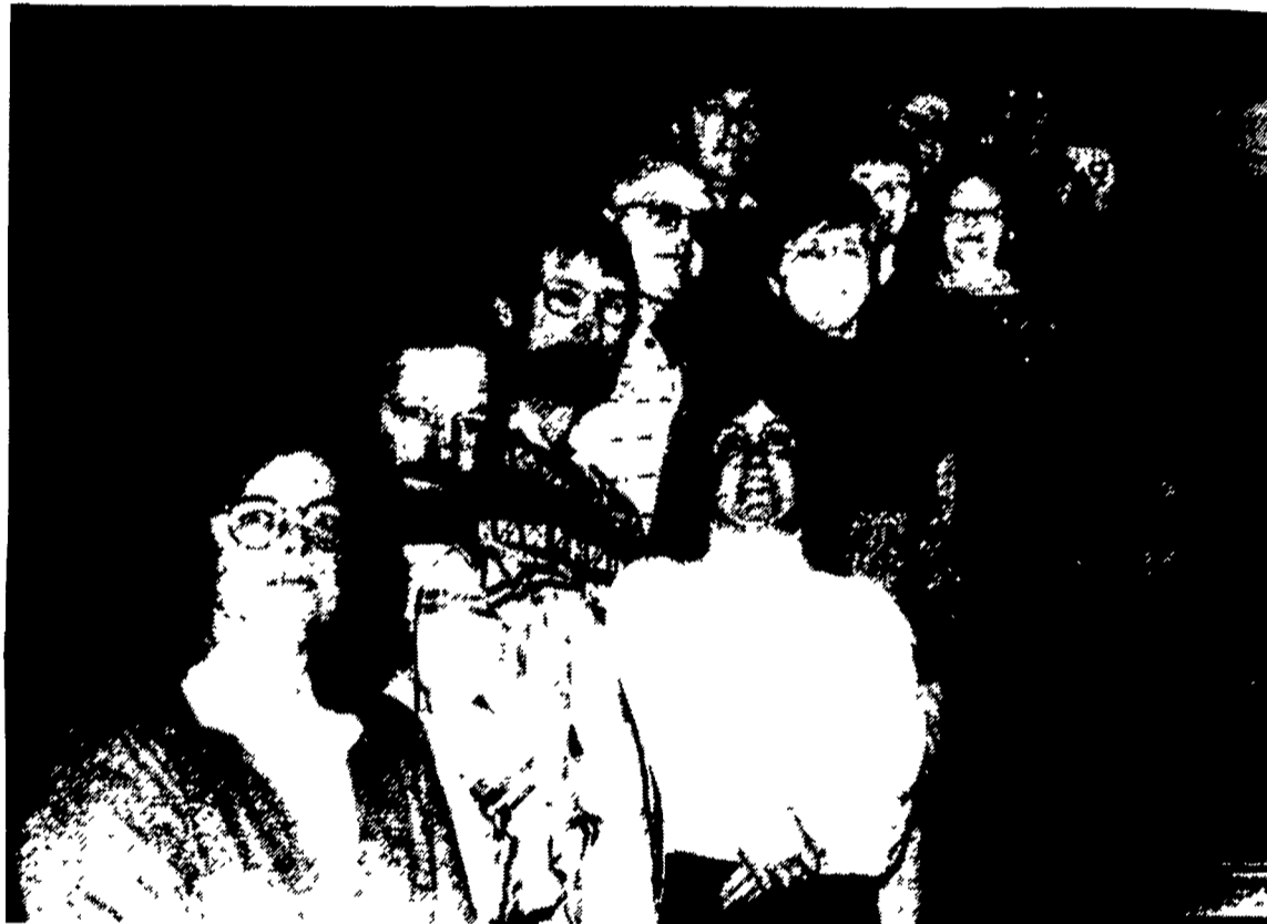
Parents were honored at the state FFA Mid-Winter Convention Monday evening at the Farm Show Complex.