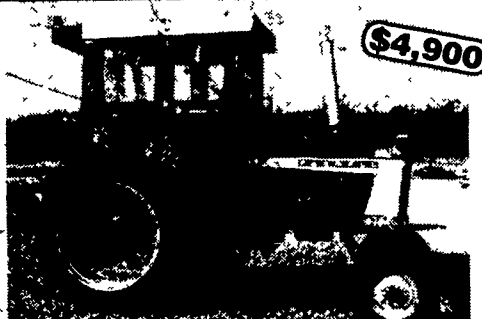
Farmall 706, WF, Gas, Cab, Runs Good TANEYTOWN FARM EQUIPMENT 410/751-1500