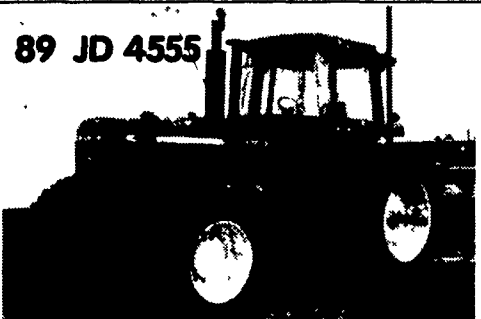
89 JD 4555 MFWD, Power Shift, Low Hours, Triple Hyd., Radial Tires. $39,500 Financing Available Weavers Equipment 717/523-9598

JD 5300 tractor, 375 hrs., 2WD, front weights, new condition.....$16,900 JD 1020, gas, PS, WFE, 3 pt., dual outlets, & JD 145 ldr., excellent condition..... $8,400 JD 750 4WD diesel tractor w/PS, 1500 hrs., JD 67 loader, 54" bucket, exc. cond... $10,900 Ford 1715 4WD, PS, ag tires, 300 hrs., w/Ford 7108 loader, 60" bucket, 5' rotary mower, like new..... $13,700 Ford 335 diesel tractor w/PS, 3 pt., PTO, industrial loader, very good condition.....$9,400 MF TO30 tractor, gas, 3 pt. hitch, good tires, runs good..... $2,900 Ford vinyl cab enclosure for 1520, 1620, or 1720 tractor.....$300 NH 273 baler w/Super Sweep pickup, bale thrower w/hyd. directional kit, exc. cond $2,400 OBO 215/536-3321