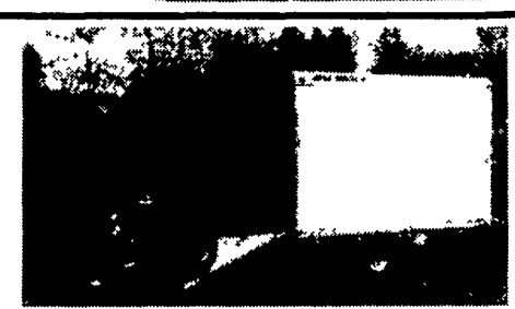
Model 1665– 12' enclosed ATV/Snowmobile trailer