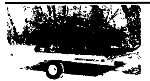
Model 1630 - 2 place all aluminum tilt bed.