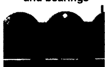
Fully protected cutter bar bottom

Vicon's KMR trailed mower conditioner combine a superb cut with excellent conditioning performance. Available in 7'10", 9'2", 10', 10'6" and 12' widths. Vicon is once again "Bringing Technology down to earth"