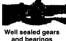
Well sealed gears and bearings