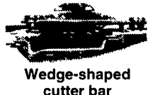
Wedge-shaped cutter bar