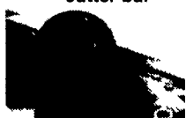
Top service hubs