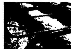
One man can put bedding material exactly where you want it without hand work

Now you can save about 75% of the time and labor for applying wood shavings, sawdust, or sand for free stall bedding. One operator can put in new bedding by himself with no hand-spreading necessary. The Millcreek Bedding Spreader is adjustable, and puts material exactly where you want it in the thickness you want. There's nothing like it for fast, efficient, and cost-effective application of bedding material in free stall dairy barns.