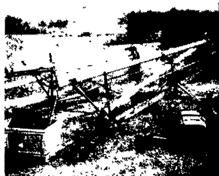
1985 Badger Lagoon Pump BN184, 540 RPM. $1,250