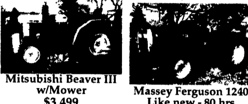
Mitsubishi Beaver III w/Mower $3,499