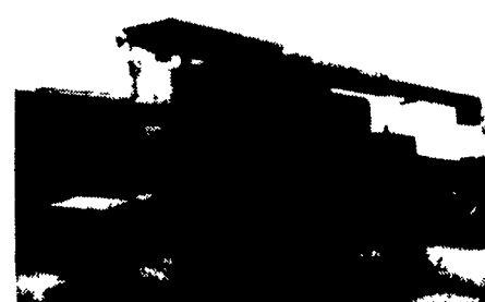
1984 MF 860 4x4 Combine Ser # 18839 2,478 Hr $18,000