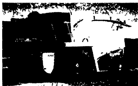
1997 Claas 840 4x4 381 HP with 10' Hay Head, 6 Row Corn Head