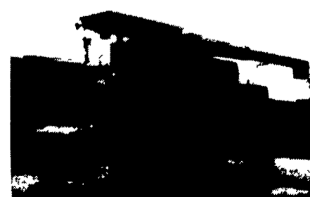
1984 MF 860 4x4 Combine Ser # 18839 2,478 Hr $18,000