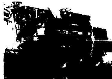
1990 MF 8460 Combine with Hillside Cleaning, 20 Ft Floating and 6 Row Corn Head, 2189 Hrs $67,000