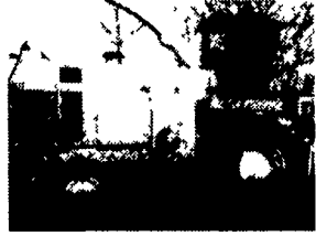
'92 JD 6810, 435 HP, 2WD, C/A, 30.5x32, 1378 Hrs., Metal Det., Hydro, Very Nice with Kernal Proc. & 6-Row Class Corn Head. $98,125