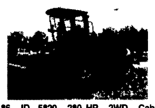
86 JD 5820, 280 HP, 2WD, Cab, 23.1x26, 3,122 Hrs., Metal Det., Hydro, Good Clean Machine $27,545