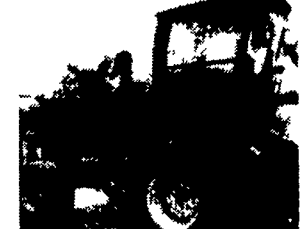
'82 JD 5820, 280 HP, 2WD, Cab, 23.1x26, 5,430 Hrs., Metal Det., Hydro, Sound Power Train. $22,500