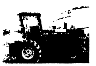
83 JD 5820, 280 HP, 2WD, Cab, 23.1x26, 4243 Hrs., Metal Det., Hydro, Good Clean Machine with 4-Row Narrow Corn head $26,635