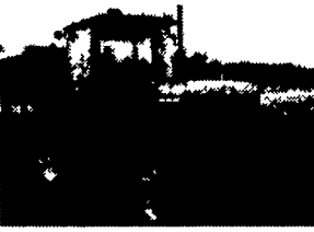
'85 JD 2950, 85 HP, MFWD, C/A, 18.4x38, 6660 Hrs., 2 Rem, Hi-Lo, Very Good $23,000