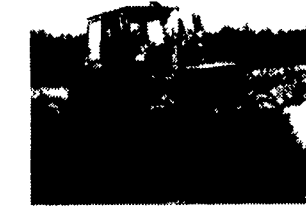
83 SAME Jaguar 95, 95 HP, MFWD, C/A, 18.4x34 (New), 4,622 Hrs., 2 Rem., 24F/6R, Very Good $14,900