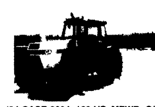
'84 CASE 2294, 130 HP, MFWD, C/A, 18.4RX38, 2111 HRS., 2 REM, PS, Good Clean $23,900