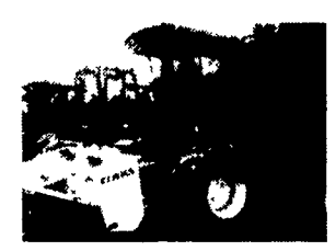
88 JD 5830, 300 HP, 2WD, Cab, 28.1x26, 3521 Hrs., Metal Det., Hydro, Good Clean Machine with Kernal Proc. & 13' Grass P/U Head & 6-Row Class Corn Head $57,665