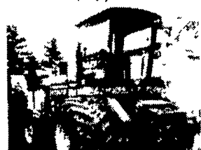
90 JD 5830, 300 HP, 4WD, Cab, 28LRx26, 2759 Hrs., Metal Det., Hydro, Very Nice With Kernal Proc. & 6-Row Narrow Corn Head $68,880