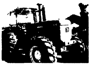
85 JD 4850, 190 HP, MFWD, C/A, 20.8x38, 3975 Hrs., 2 REM, PS, Very Nice $44,500