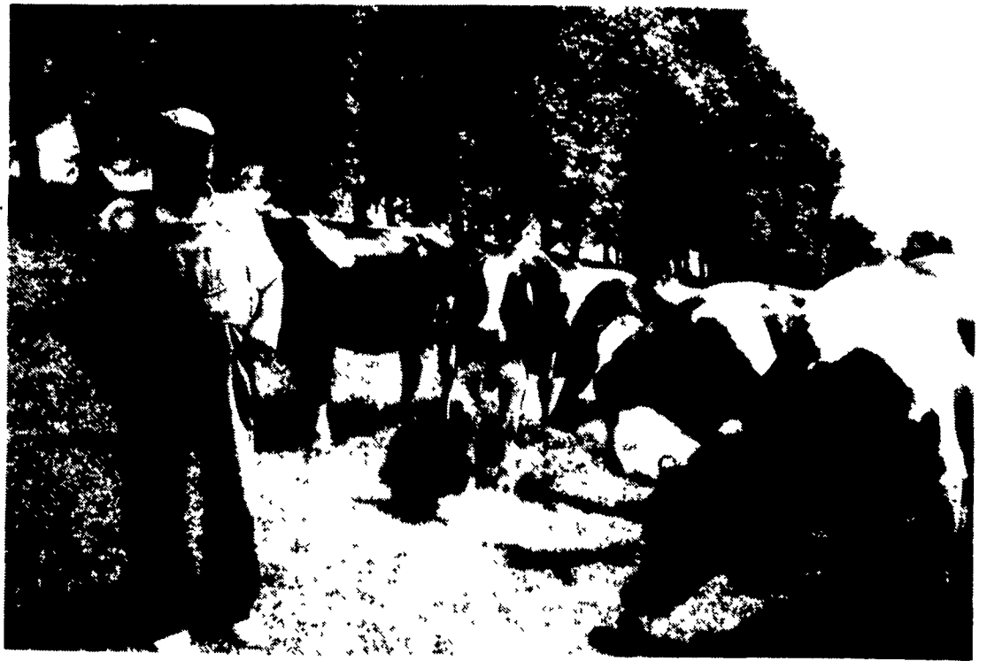
Growthy helpers and well conditioned dry cows provide a good start for the next year's milk production.

When the children all lived at home, the family raised fruits and vegetables and ran a farm market in addition to the 50-cow dairy and corn and hay crops. However, the market was discontinued last year because of lack of time and not enough