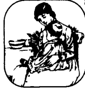
Makes 8 servings.

thyme and mushrooms and cook 5 minutes. Add broth and seasonings. Simmer covered for 30 minutes. Puree soup in a blender and serve hot, garnished with chives. (If desired, the mushrooms can be sautéed separately and added after the soup is pureed.)