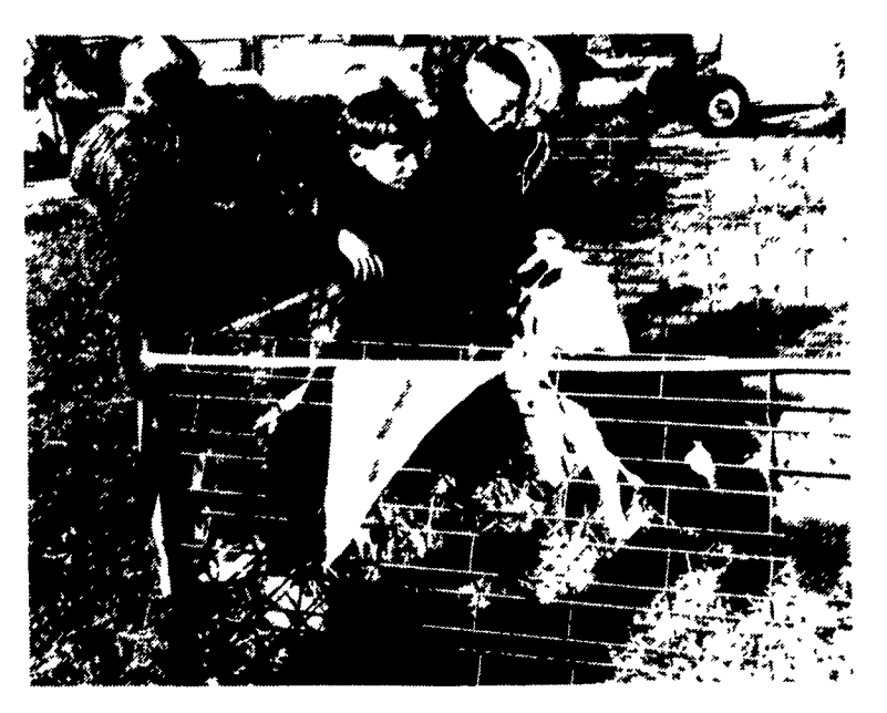
The Cedar Crest FFA recently conducted a petting zoo at one of their elementary schools. The students enjoyed petting this Holstein calf.

The Cedar Crest FFA recently held a petting zoo at Ebenezer Elementary school as part of its fall harvest day.