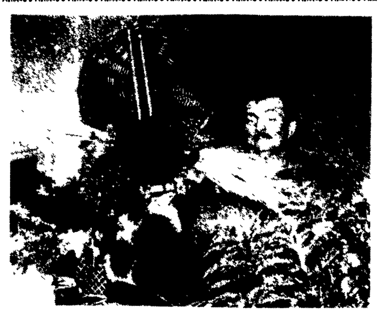
Floral style comes by combining usual items in an arrangement.

Makes swags by wiring greens together, decorate with fruit picks, ribbon, or put single flower in center of swag. Add beads, ribbons, or preserved flowers and weeds if