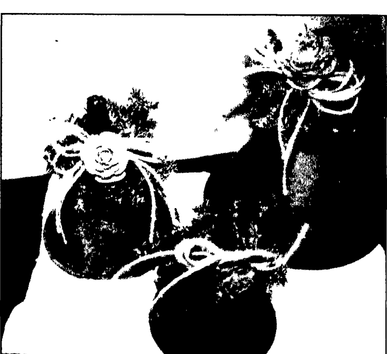
Group together three funnels, add greens and jute bows for a festive holiday touch.