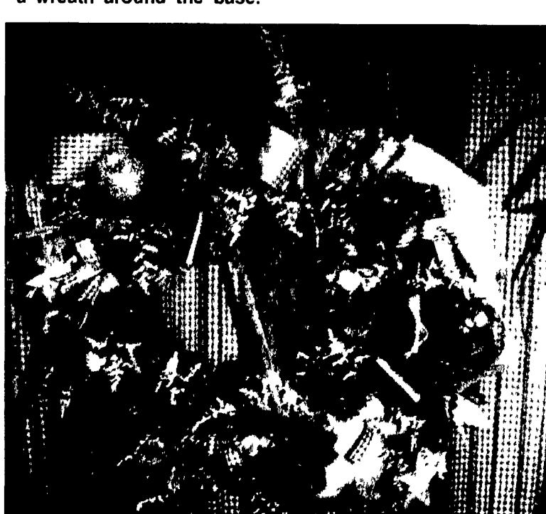
Give new life to old wreaths by removing discolored ribbons and balls and replacing with gingham ribbon and other materials.