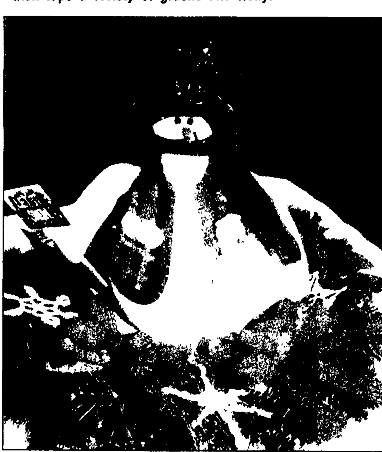
Showcase some of your favorite holiday crafts by placing a wreath around the base.