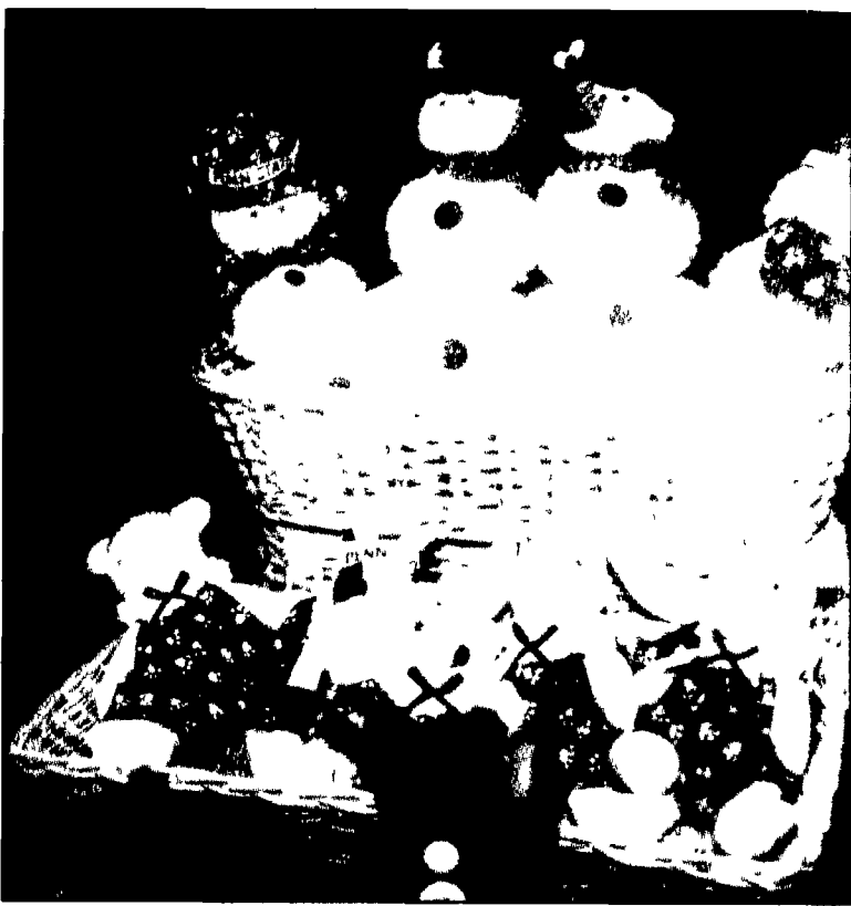
Yesterday's chenille bedspread can be recycled into these delightful snowmen.