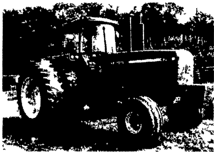
1990 JD 4755, 4,000 Hrs., Cab/Air, 2WD, Duals .....$50,000 Q