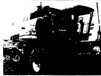
1988 JD 6620, Tital II Sidehill, 3,222 Hrs., 2WD, Hydrostatic.....$42,000 W