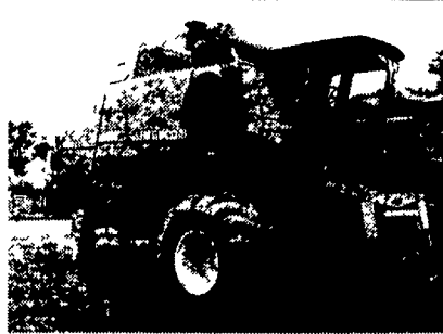
1980 JD 6620 SH, 4,853 Hrs., 2WD, Hydrostatic Straw Spreader.....$25,000 W