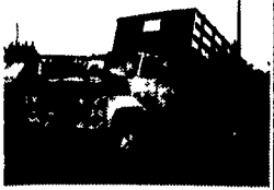
1985 GMC C-70 16' Flat Bed Dump, 366 V8, Gas, 28,000 GVCW, 5 Speed, 120,800 Mileage