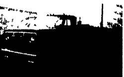
1984 GMC 7000, 366 V-8 Gas, 5+2 spd Trans, Hyd Brakes, New Paint Color, Red 28,000 GVW, 108,184 Original Miles, New Tuneup, New Service, New Tires, New Brakes, PA State Insp