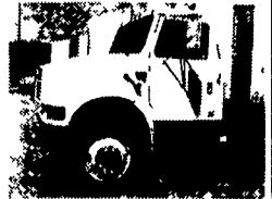
1991 IHC 4900, GVW 32,500, Budd Wheels, DT 466, Eng 210 HP, 6 Speed Trans, Air brakes, New Paint - White

Menac 45' flatbed trailer, 1986 w/Tico 6-ton traveling boom (same as Hiab), $11,000. 717/354-3105.