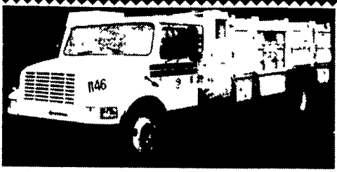
'91 Int. 7.3 engine, auto trans, air ride, rear compacter plus side dump bins $9,500 - 610-944-9871 after 5 pm