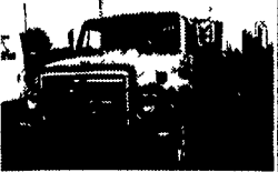
88 IHC 1654S GVW 3,600 Lbs., Mileage 146,000, Gray, Metallic Cab, 6.9L Diesel Eng, 545T Automatic Allison Trans, Hydraulic Brakes, PS, No AC, Has 14 Ft Duralite Body, White, Rollup Rear Door, No Side Door, Has 2,500 Lb Liftgate