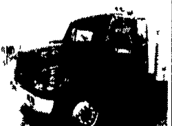
1995 IHC 4700 27,500 GVW, 81,176 Miles, Red, DT-466 210 HP Eng, 5 Spd Manual Trans, Hydraulic Brakes, PS, No AC