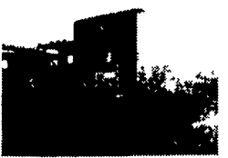
1993 Ford CF 7000 26,000 GVW, 5 Speed Trans, 6.6 Ford Diesel, 22' High Cube Body w/Lift Gate