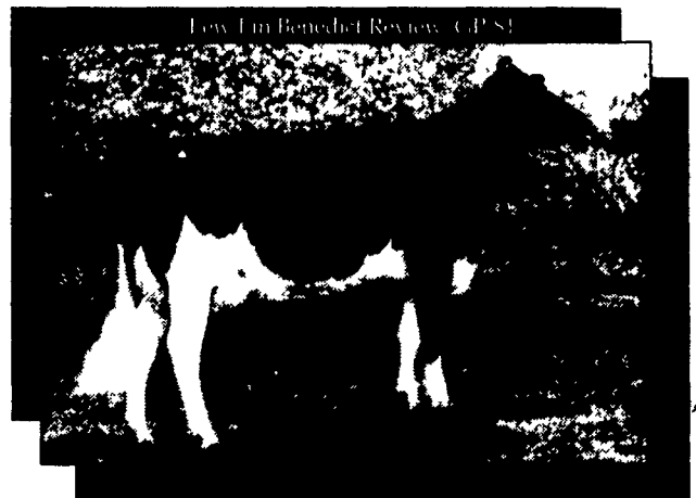
BENEDICT +.12% and +93f +1519 TPI and +2.48 F.L.C.

The Game is the same—breed a profitable cow that will produce beyond your expectations. However, the rules are constantly changing. Fat is now back in the equation. But don't worry, Sire Power's super fat sires will keep you at the top of your game!